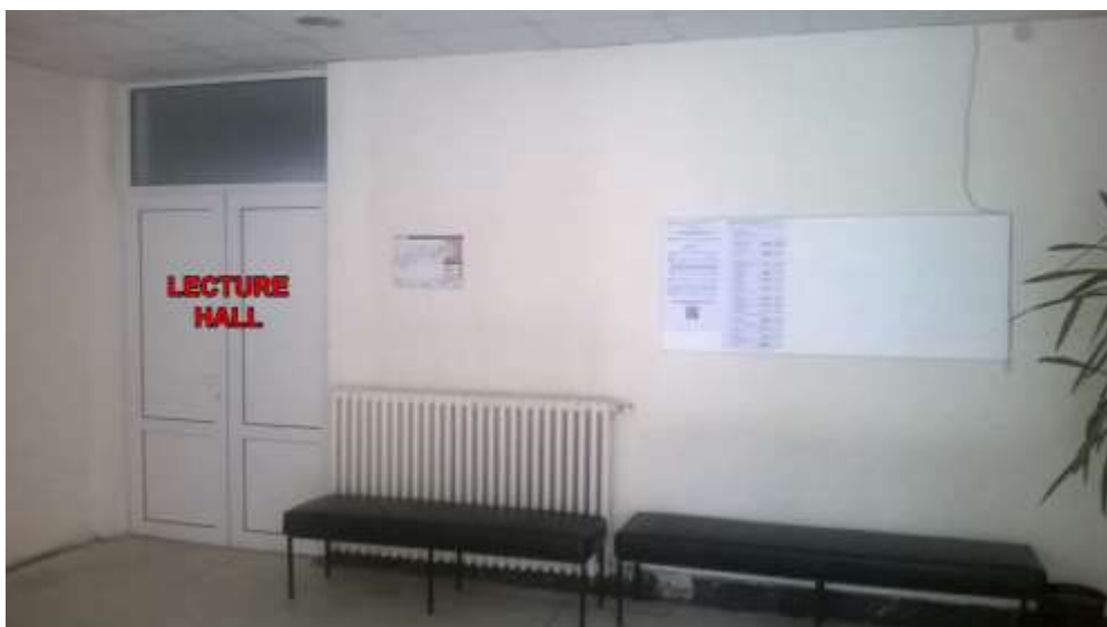
Figure 4. Entrance to the Lecture Hall – as soon as you enter the building you will see the Lecture Hall door to your left