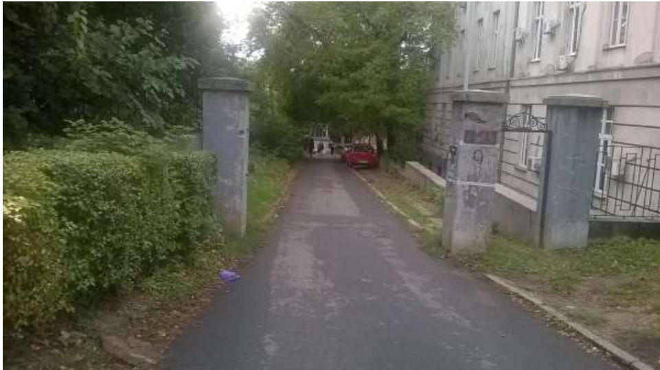
Figure 2. Street view of the alley descending from Dr Subotica street towards the Pathophysiology building. The building partially seen on the right is Clinic for internal medicine