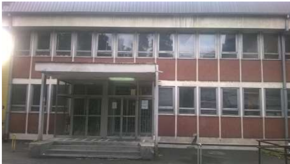
Figure 3. The Pathophysiology building located at the bottom of the alley from the previous picture